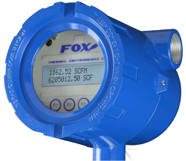
The Model FT4A flowmeter and temperature transmitter is approved for FM/FMc Class I, Division 1, ATEX/IECEx Zone 1. CE Mark. Accuracy compliant with BLM 3175 & API 14.10.