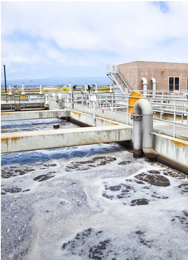
Wastewater Treatment Plants (WWTPs) use air, fuel, and biogas flow meters in their processes.

In wastewater aeration, one of the most important factors for proper treatment is the determination of how much air volume in standard cubic feet per minute (SCFM) will be needed to deliver the mass of air required for optimal bacterial biodegradation of organic matter.